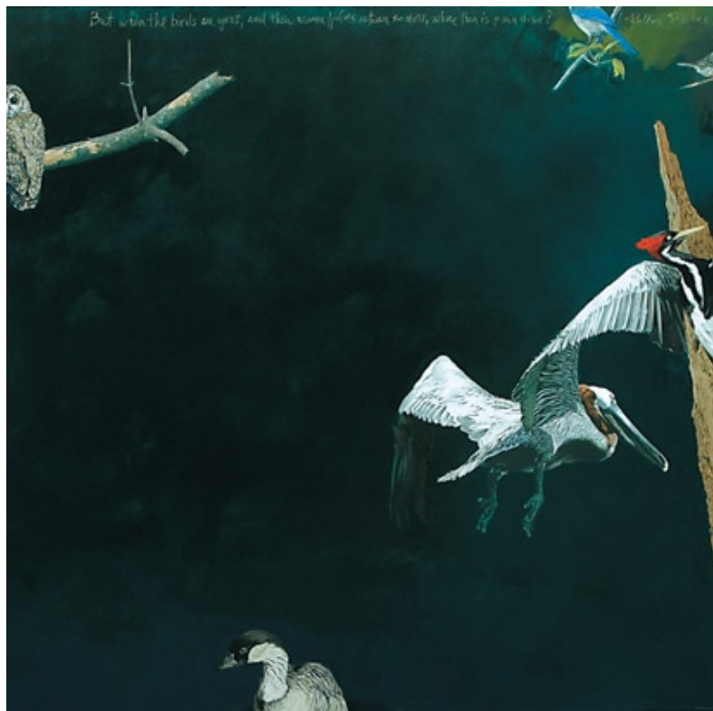
Mark Eberhard (United States, b. 1949), On the Edge , 2008, oil on canvas, 60 x 60" JKM COLLECTION©, NATIONAL MUSEUM OF WILDLIFE ART. ©MARK EBERHARD